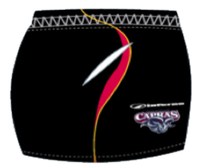
Gold Short sponsor logo