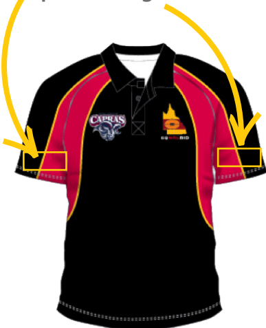
Gold Shirt sponsor logo